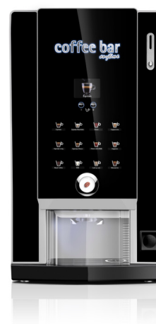
Doppio (Front view)

* Information not available when document created. Will be added in later version